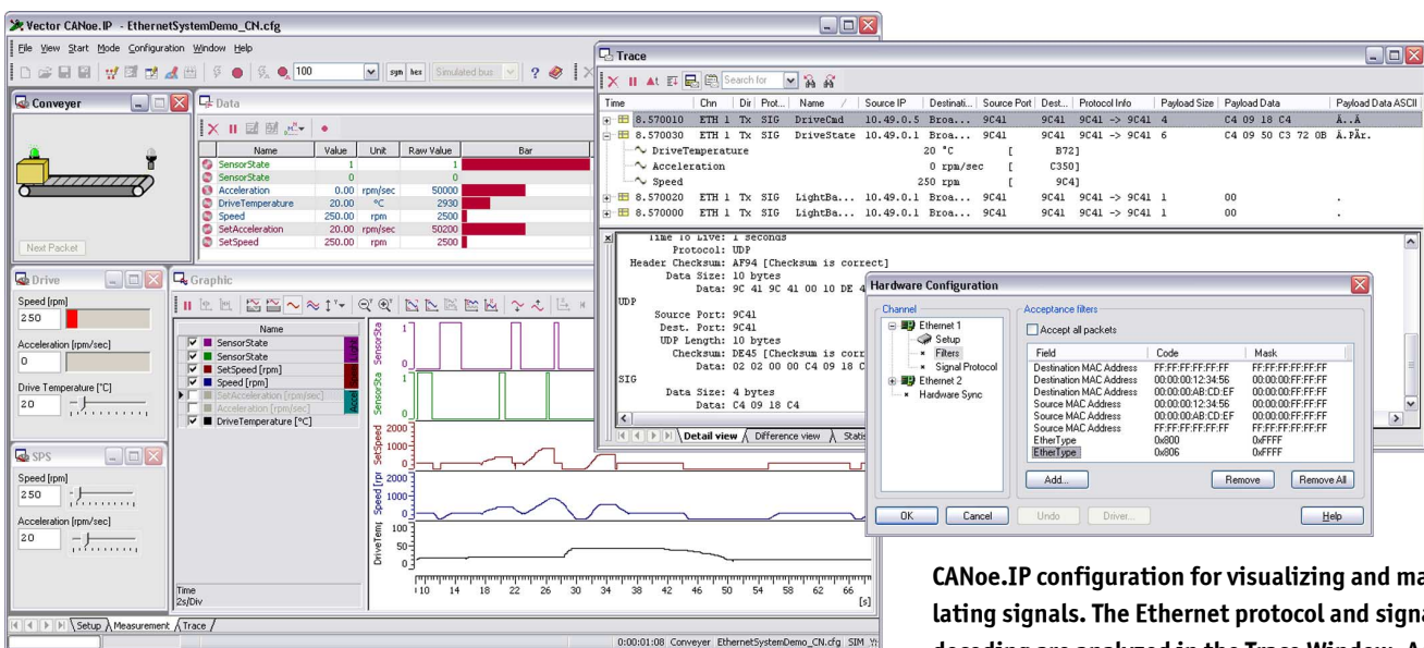
CANoe.IP configuration for visualizing and manipulating signals. The Ethernet protocol and signal decoding are analyzed in the Trace Window. Acceptance filter for reducing the number of packets.

In vehicle development , the use cases involving support of Ethernet-based networks are generally the same as those in CAN bus systems. Moreover, the function Remote CAN Analysis opens up additional fields of use, such as simultaneous analysis of the data communication of multiple vehicles in Car2x systems, as well as remote control of engine test benches and HIL tests.